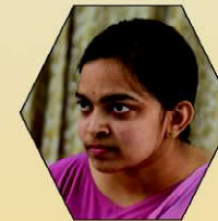
YERRAMSETTI USL RAMANI AIR - 583